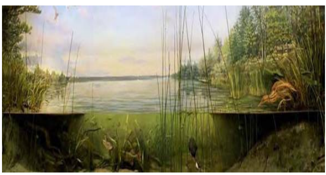
Aquatic plants provide an underwater forest of habitat promoting healthy balanced aquatic eco-systems.