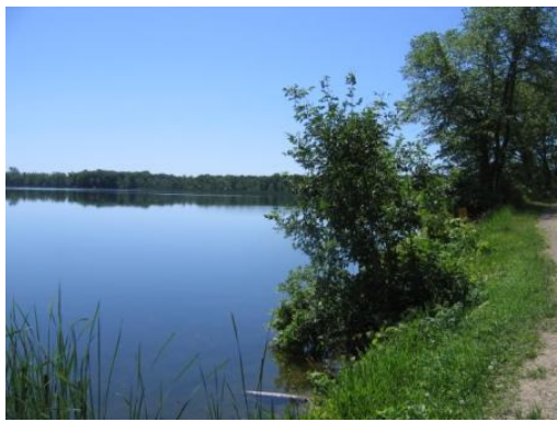
Shoreline bank area that is stabled and buffered by emergent aquatics and good bank growth.